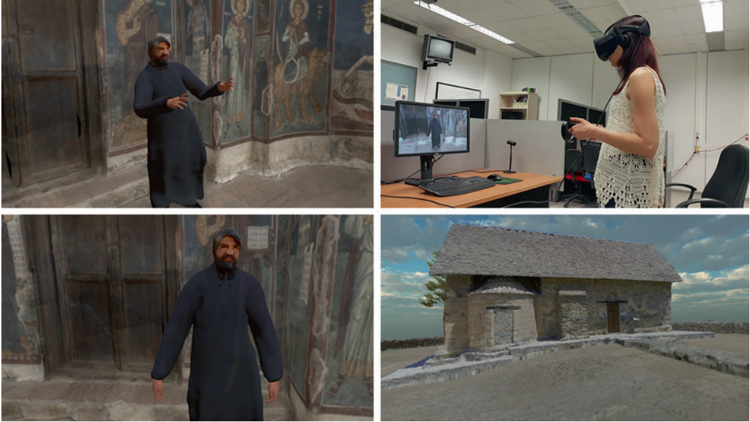
Mixed Reality, Gamified Presence, and Storytelling for Virtual Museums, Fig. 1 The hologram of the priest of the Asinou Church and the viewer interacting via

gestures through Microsoft HoloLens, in the ITN-DCH project (Papaefthymiou and Papagiannakis 2017)