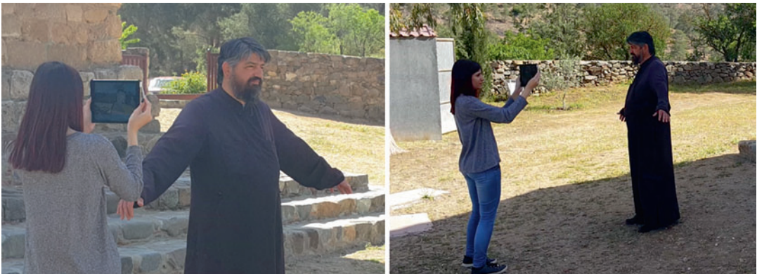
Mixed Reality, Gamified Presence, and Storytelling for Virtual Museums, Fig. 2 Digitization of the priest of Asinou Church (to reconstruct his 3D model as a virtual

gestures through Microsoft HoloLens, in the ITN-DCH project (Papaefthymiou and Papagiannakis 2017)